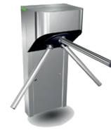
TL1 Stainless steel