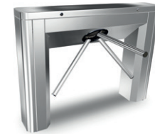
TL2 Stainless steel